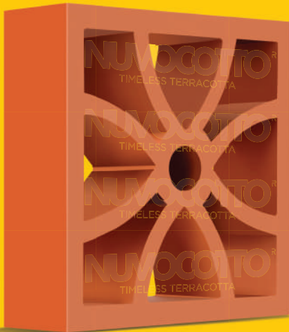
FOUR PETAL JAALI

Size 200 x 200 x 60 mm Requirement Per Sft: 2.25 Nos